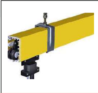
BUSBAR & CURRENT COLLECTOR