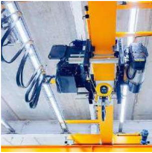
WIRE ROPE HOIST