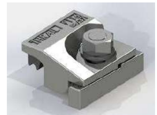
CRANE RAIL CLIPS