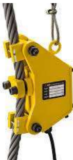
CRANE LOAD LIMITER