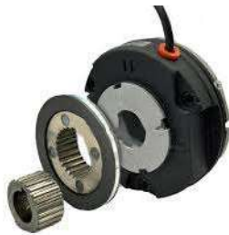
ELECTRO MEGNATIC BRAKE